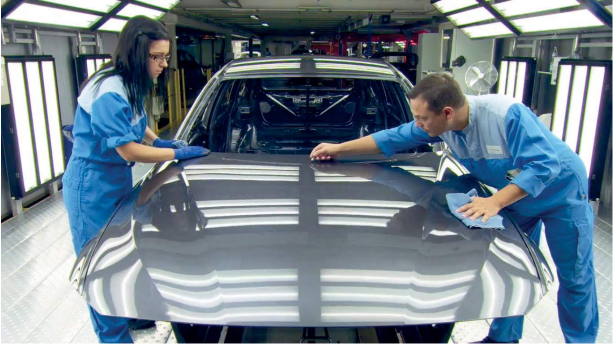
Figure 11: Car production quality control

35. Figure 11 shows quality control taking place in a car production plant.