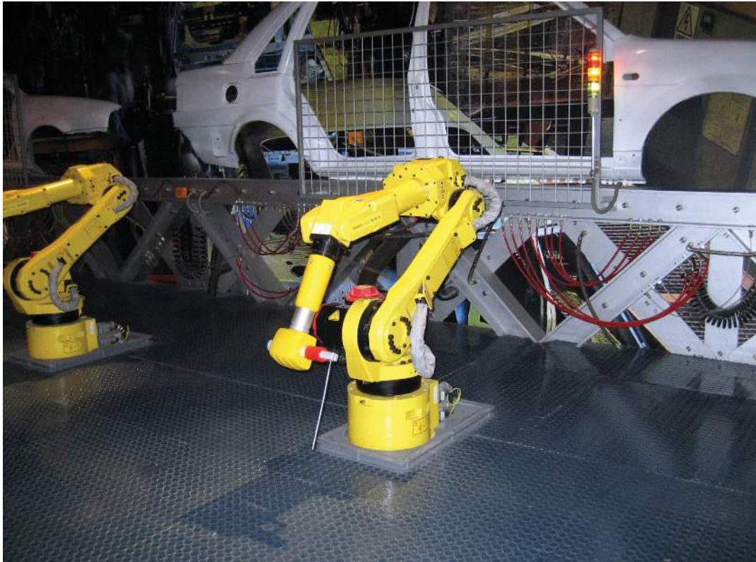
Figure 10: Computer integrated manufacturing

[Source: https://commons.wikimedia.org/wiki/File:Robot_worker.jpg Mountain at Shanghai Science and Technology Museum (Wikimedia Commons)]