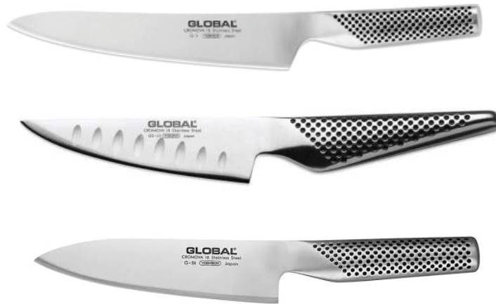
Figure 7: Global knives

22. Figure 7 shows a range of Global knives which have a textured surface on the handle.