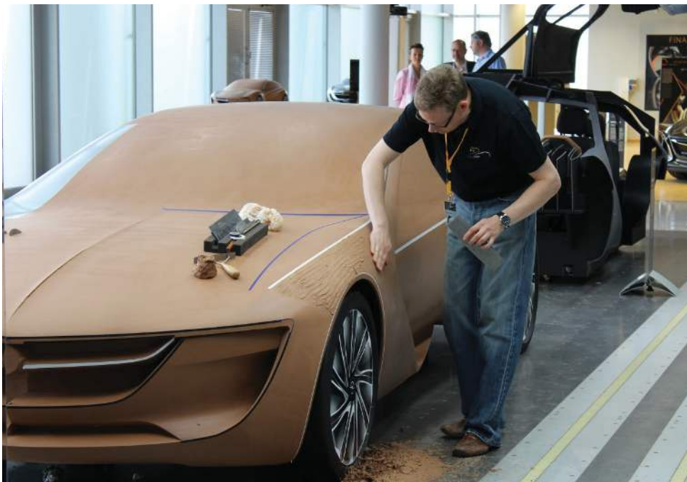
Figure 3: A clay model of a car