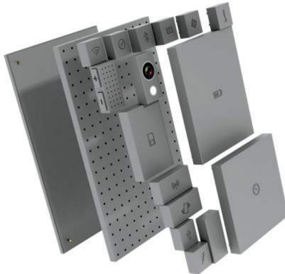
Figure 5: Phonebloks