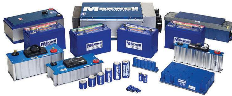
Figure 9: Maxwell Technologies products

28. Figure 9 shows related products manufactured by a single company, Maxwell Technologies, Inc.