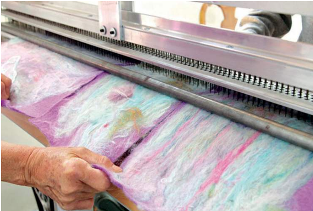
Figure 4: A textile process