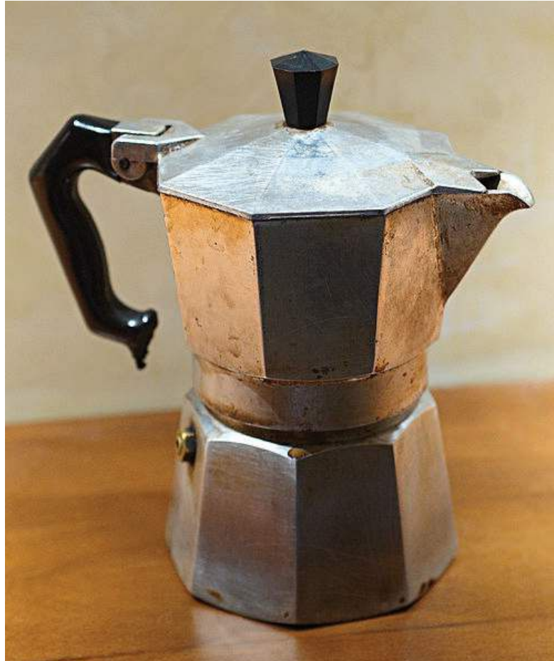
Figure 6: A coffee maker