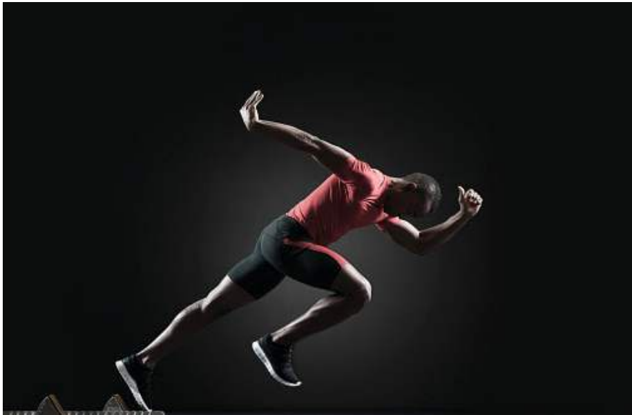
Figure 1: Athlete in sports laboratory